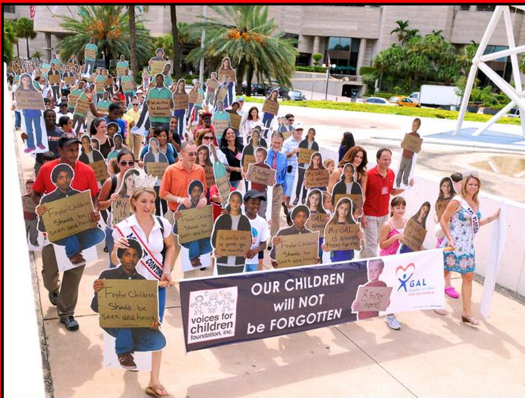
Hundreds march to show support for the end of child abuse and to remember the children that silently enter Foster Care each day.

Every day, 850 of our nation's children silently enter an intimidating and unfamiliar Foster Care system. That averages to 6 children a day in Miami-Dade County alone. The purpose of the Forgotten Children campaign is to raise awareness of this stunning statistic and BE A VOICE in the community expressing that these children will not be forgotten.